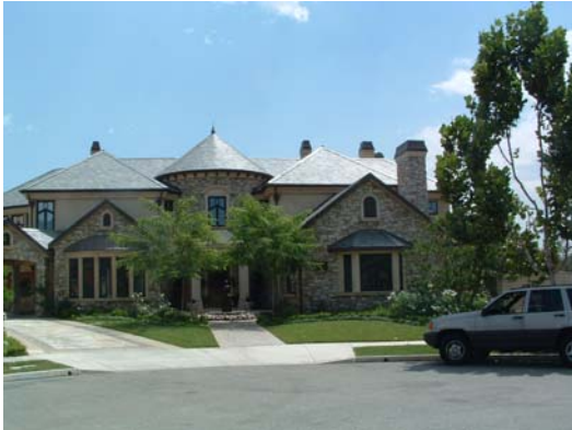
WESTRIDGE ESTATES CUSTOM HOME Lot 120 6000 sq ft. two story custom home Located in the Westridge Estates at 25520 Oak Savannah Cr. Valencia, CA. French Normandy style architecture, with slate roof, wood windows, stone exterior walls. Completed value estimated at $3,200,000.