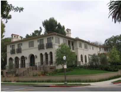
HOLMBY CUSTOM HOME – Three story, 10,000 sq. ft. located in West Los Angeles, CA Completed value estimated at $8,000,000.